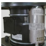
IP55, external terminal ATEX capacitor box

External terminal box, easy access, IP55, fireproof plastic V0.