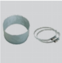
ACOPEL EX N Explosion proof flexible connection.